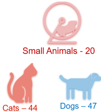
(Visual of the type of animal MSAR brought into care in the third quarter)

This quarter, your support helped Mending Spirits bring in $66,868 in income and cover $44,017 in expenses — leaving $22,615 to reinvest into upcoming rescue work.